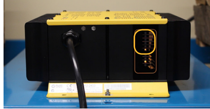
Figure 5: Charge profile #1 on the ammeter.