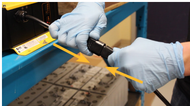
Figure 3: Reconnect AC power to the charger.