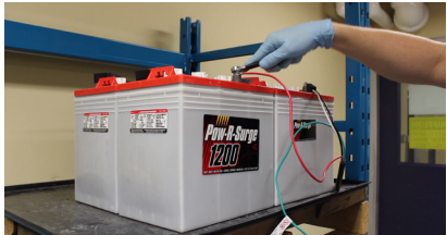
Figure 2: Remove positive lead from positive terminal on the battery pack.