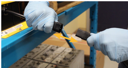
Figure 1: Disconnect AC power.