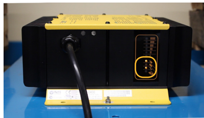
Figure 6: Bulk charge indicator displays charge profiles 7 and above.