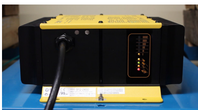
Figure 4: Charger LED indicator self-test.