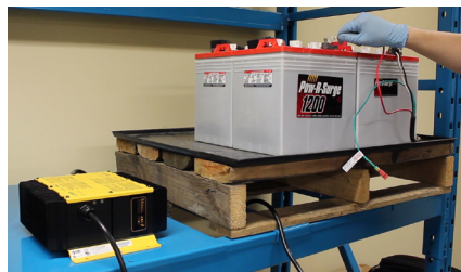
Figure 7: Touch the positive lead to the positive battery terminal for 3 seconds.