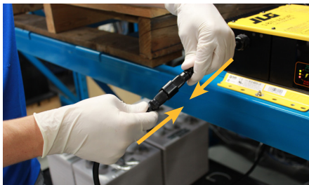
Figure 4: Reconnect AC power to the charger

5a. For 11 seconds after the self-test, the charger will display its default charge profile. Profiles are indicated by the number of consecutive flashes followed by a pause (e.g. #2 = ☀️☀️⏸️☀️☀️⏸️☀️☀️).