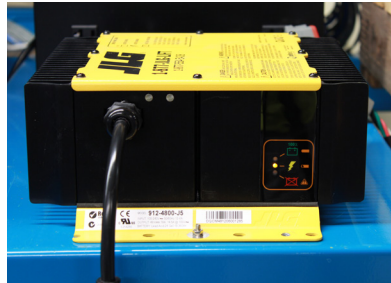
Figure 5: Default charge profile is displayed by the amber charging indicator light

5a. For 11 seconds after the self-test, the charger will display its default charge profile. Profiles are indicated by the number of consecutive flashes followed by a pause (e.g. #2 = ☀️☀️⏸️☀️☀️⏸️☀️☀️).