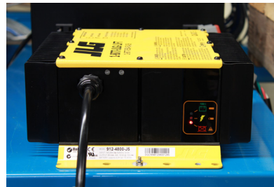
Figure 6: Red fault light blinking

6. After 11 seconds the the red fault light will then blink.