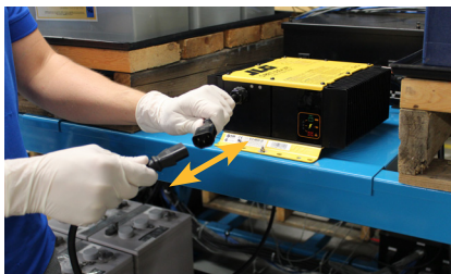
Figure 2: Disconnect AC power.

2. Disconnect the AC power source from the charger, either from the wall outlet, or from the IEC320 connector on the charger.