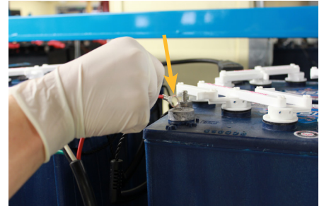
Figure 7: Touch the positive lead to the positive terminal for 3 seconds

9. Touch the positive lead to the positive terminal for 3 seconds (+/- 0.5 seconds), then remove the lead. You will see the next profile displayed on the charger's display. Repeat this step until you reach the desired charge profile.