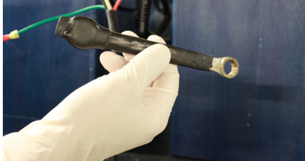
Figure 1: Insulated wrench and gloves

1. Required supplies include an insulated wrench, eye protection and gloves.