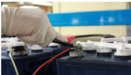
Figure 3: Remove positive lead from positive terminal on the battery pack

3. Use your insulated wrench to remove the positive lead from the positive terminal on the battery pack.